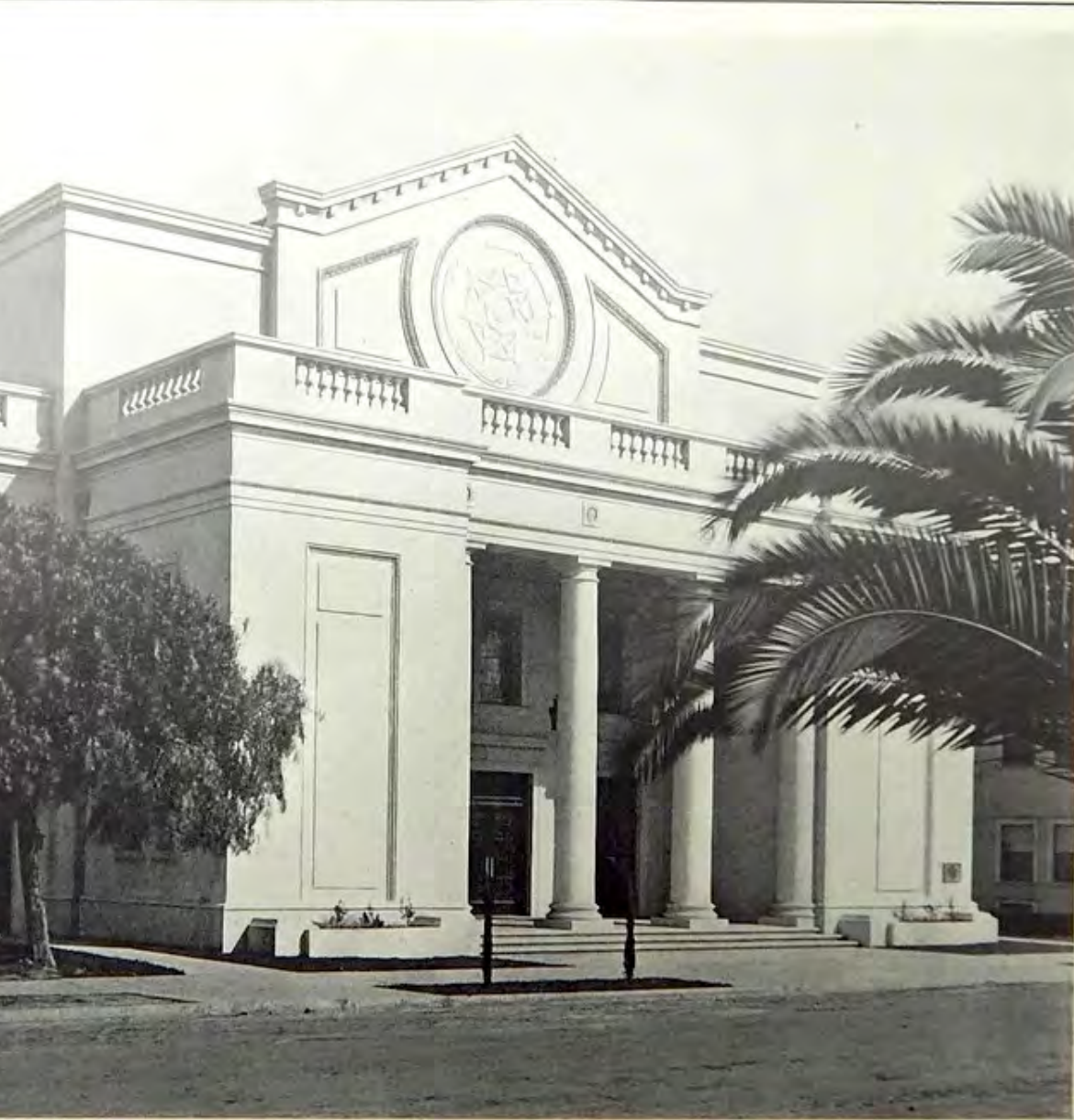
CHURCH OF CHRIST SCIENTIST, LONG BEACH, CAL.