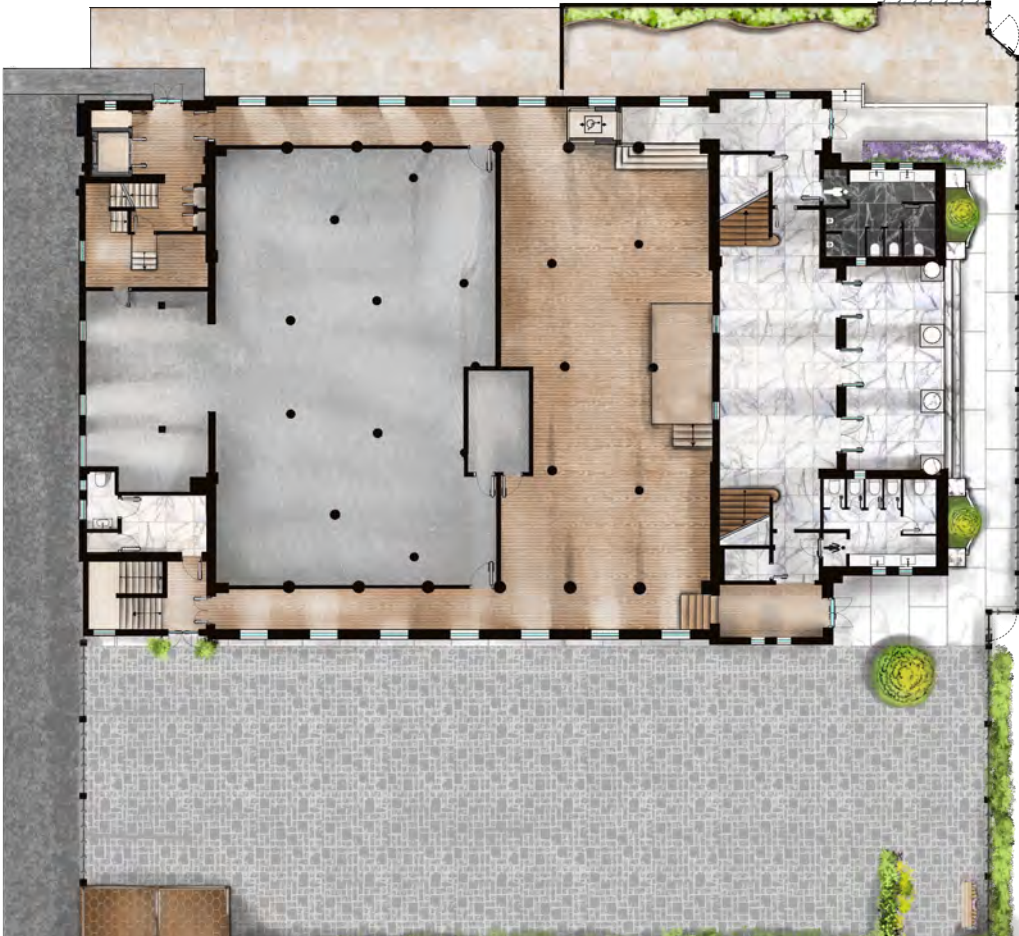
1st Floor Parlor & Plaza